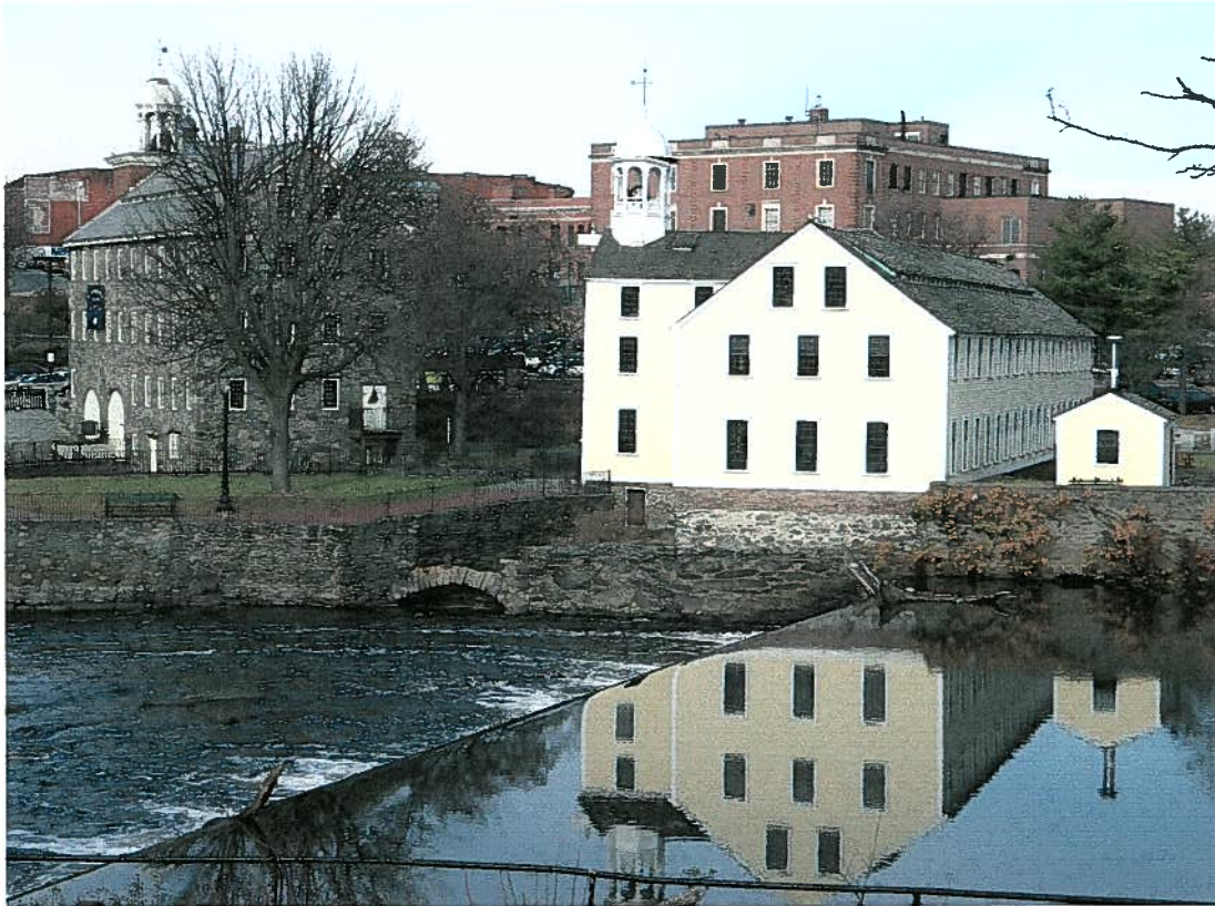
The Historic Slater Mill